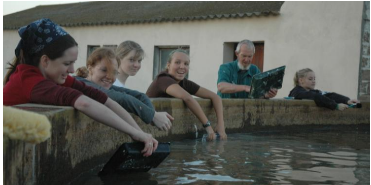
During the GCC we were able to help the KwaSizabantu mission paint the new ladies dormitory, later we painted the reservoir.

The KwaSizabantu mission in Malmesbury has been expanding its buildings in order to accommodate the growing number of people who go to them for help and counseling. Over the holidays, some of us from Frontline Fellowship were able to help them with their building projects including painting rafters and reservoirs, planting corn fields, and preparing their new sanctuary. It is a