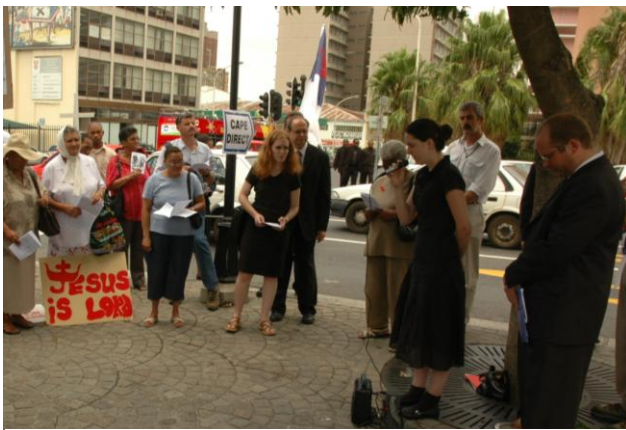
This demonstration protested the legalization of abortion in South Africa in 1997, and remembered the 600,000 babies that have been killed as a result.

In the beginning of January they held their first youth camp. At this camp, many young people from the Cape Flats came to the Lord in repentance and submission. KSB will be holding a second camp sometime in March to continue discipling these kids.