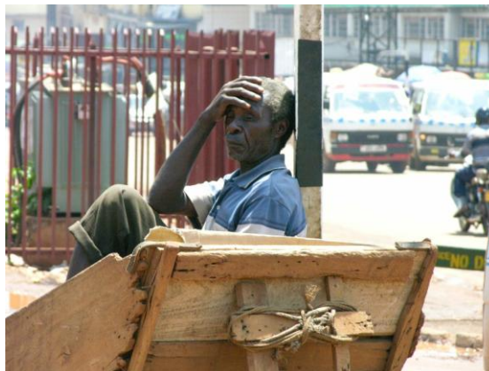
There is no shortage of ministry opportunities in South Africa.

The sun rises over the Cape- the tip of the African continent- in an extraordinary display of oranges and yellows. It rises over a country of beautiful wildlife and rampant crime, over an array of unique cultures, and many too-common sins. The Afrikaans people, the only speakers of a Dutch-Anglo language, have a heritage rich with Christian leadership, yet this was lost to a government that has just legalized homosexuality; abortion was legalized 10 years ago. The people of South Africa have always stood up for their country and their God. Unfortunately, what their country stands for is no longer godly or even honorable, and they no longer follow the Jehovah God- often it is no more than the god-idol of man and humanism.