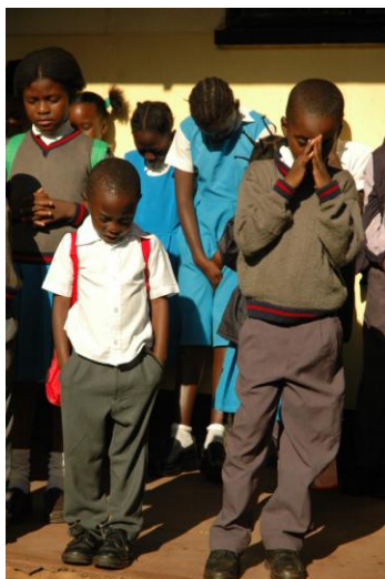
Morning devotions at Excellence Christian Academy in Zambia.

Please continue to pray for me. Please pray that the Lord will: