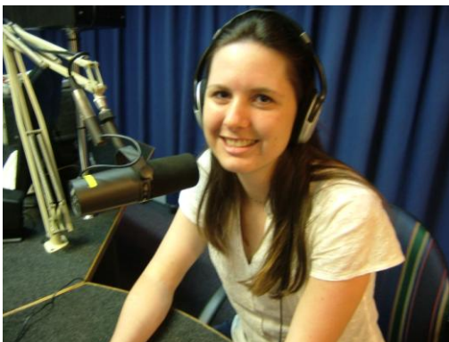
Salt & Light reaches both the English and Afrikaans speaking peoples of South Africa.

I enjoy working with WCBI because it gives me many opportunities to interact with and disciple people throughout Africa through correspondence and administration of their course work.